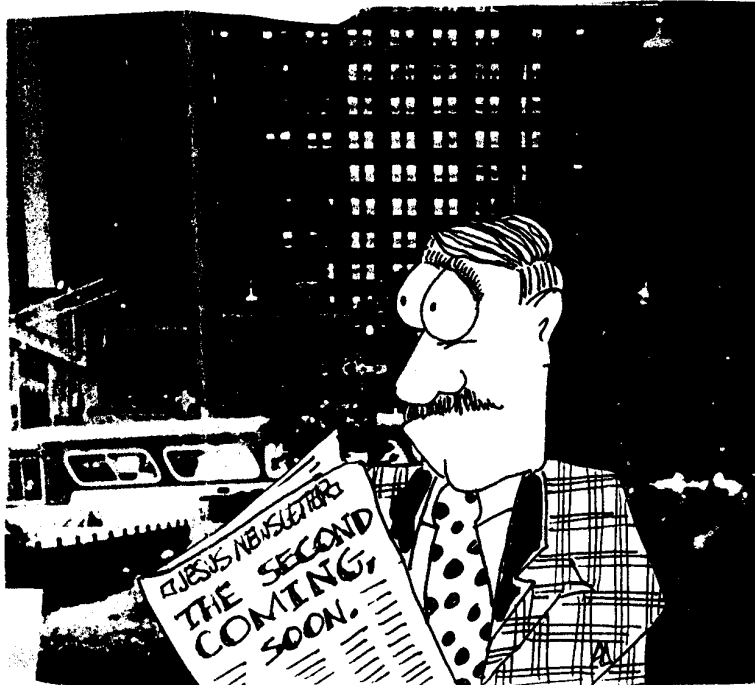
IN A WORLD OF MANY VOICES