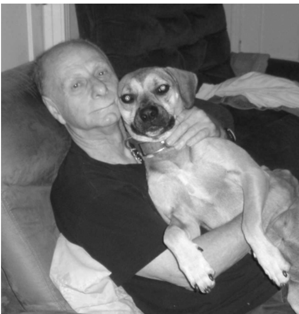
“I love my dog, I can’t be all Bad!”

E-mail address: jesuspeoplemin@sbcglobal.net