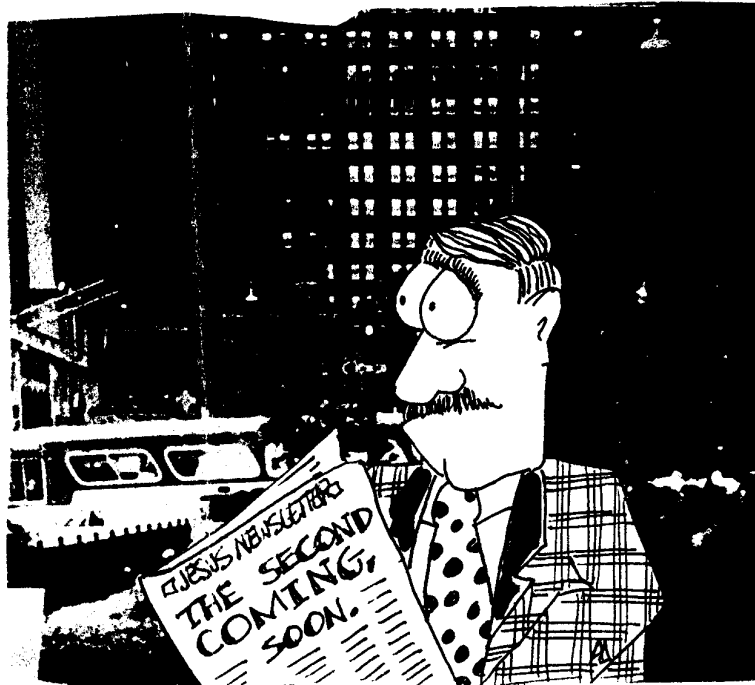
IN A WORLD OF MANY VOICES